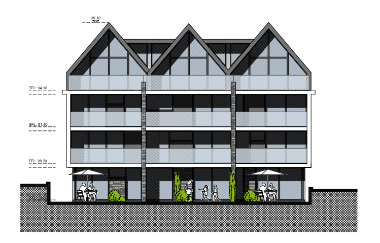
FRONT SOUTH EAST ELEVATION SCALE 1:100