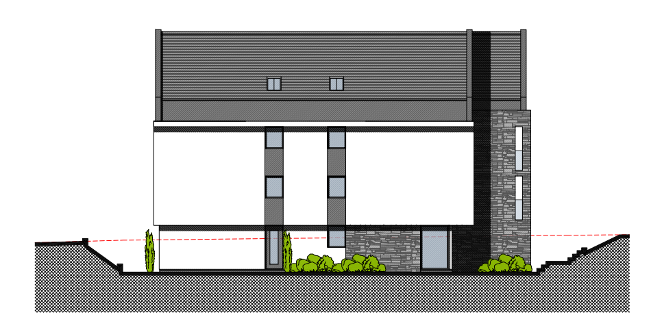
SIDE SOUTH WEST ELEVATION SCALE 1:100