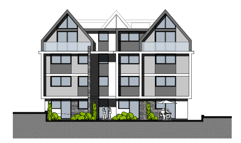
REAR NORTH WEST ELEVATION SCALE 1:100