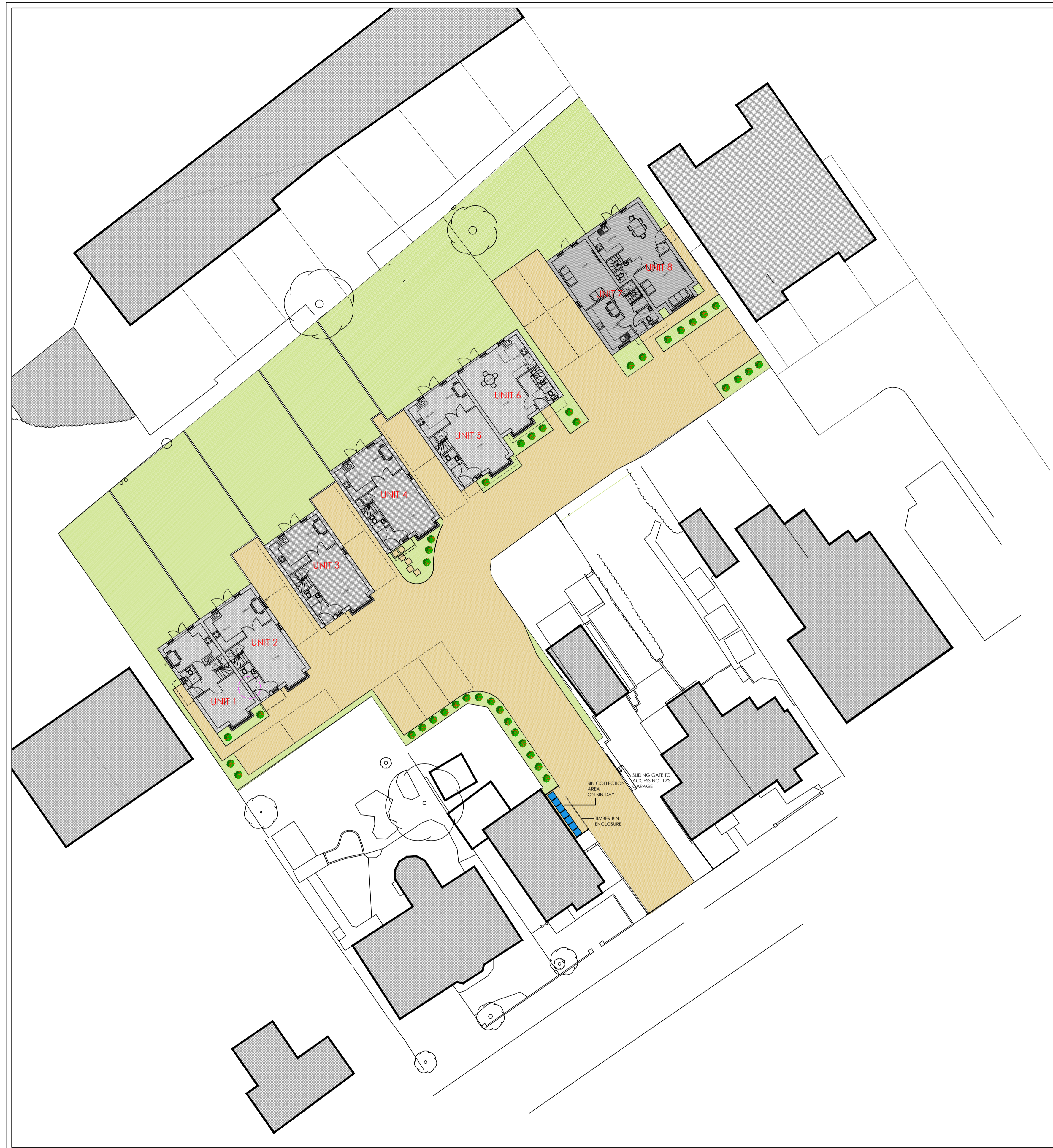
PROPOSED SITE PLAN SCALE 1:200 BASED ON TOPOGRAPHICAL SURVEY INFORMATION