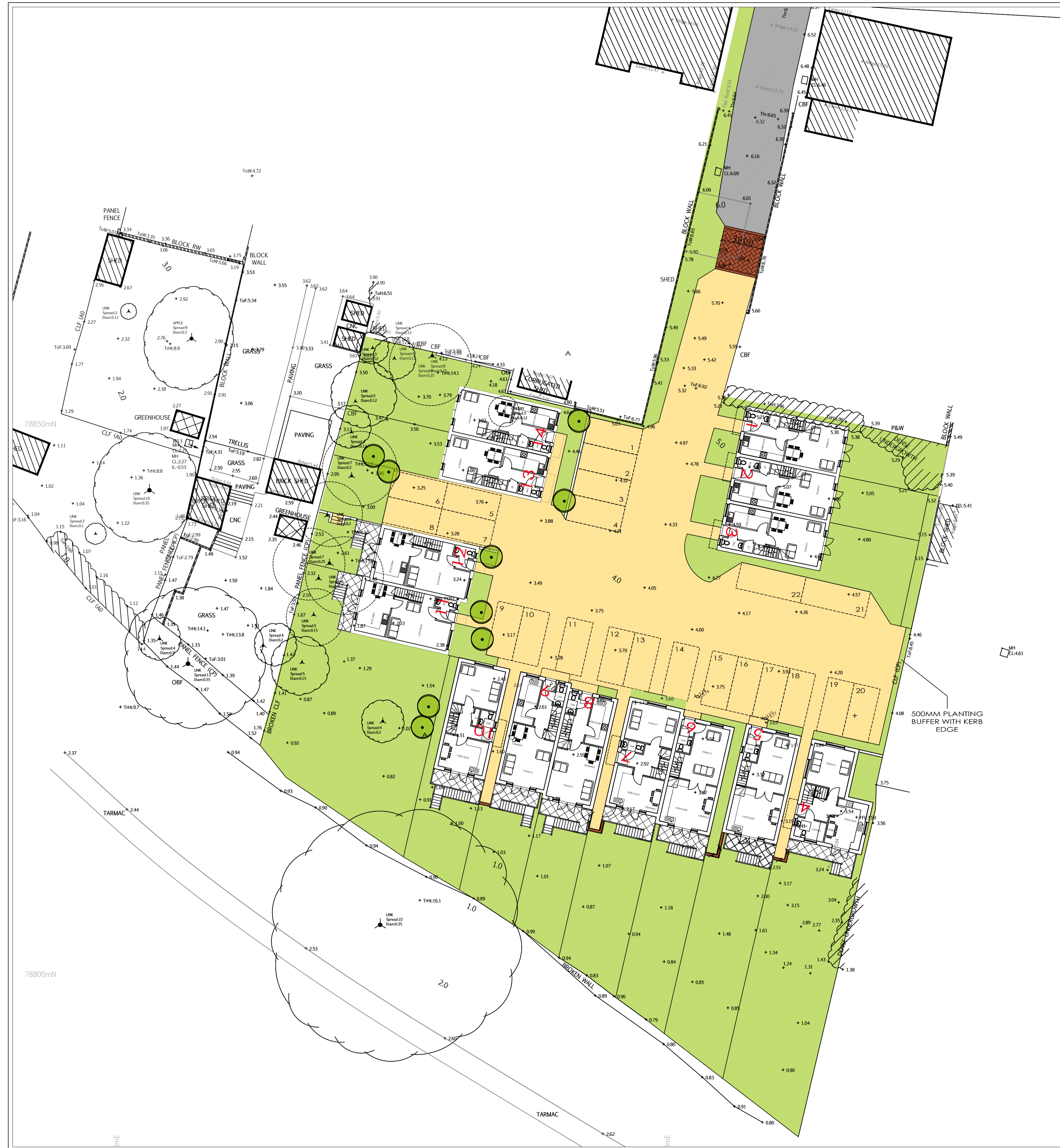
SITE PLAN BASED ON TOPOGRAPHICAL SURVEY INFORMATION SCALE 1:200